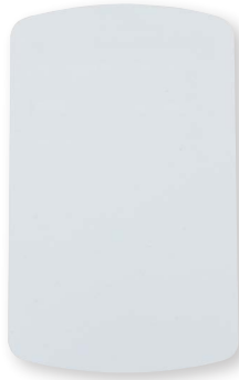
North American Style